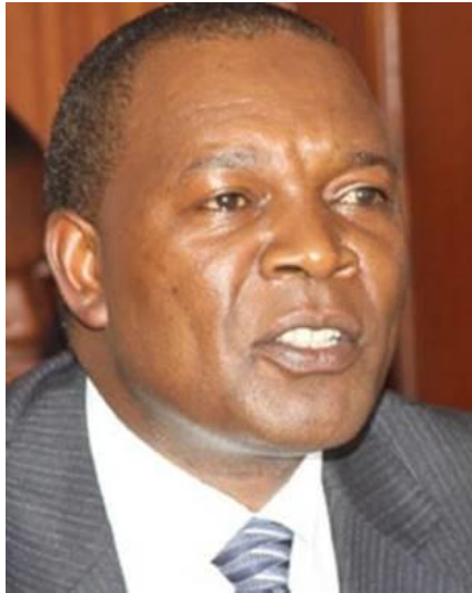
Njuguna S. Ndung'u

Professor Njuguna S. Ndung'u is the former Governor of the Central Bank of Kenya, a position he occupied for two consecutive four-year terms, from March 2007 until March 2015. He is an economist, a university professor and a researcher. Prior to his appointment as Governor, he was the Director of Training at the African Economic Research Consortium, (AERC), a Pan African premier capacity building network. He also worked as a regional programme specialist for the Eastern and Southern Africa Regional Office, Nairobi, of the International Development Research Centre, Canada and at the Kenya Institute for Public Policy Research and Analysis as a principal analyst/researcher and head of the Macroeconomic and Economic Modelling Division. He led a team to develop the Kenyan micromodel that has been in use for forecasting growth and fiscal stance since 2001.